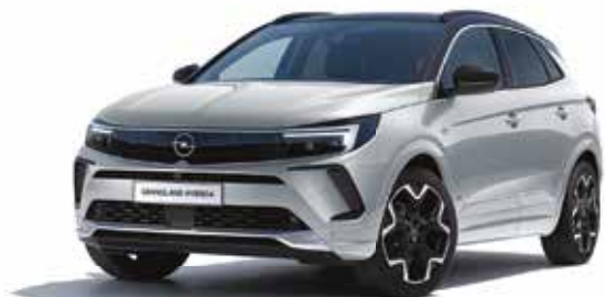
Quartz Grey* 2-