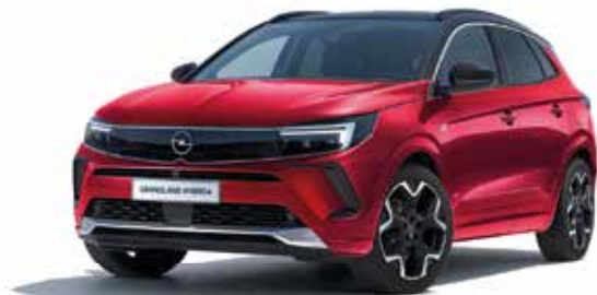
Dark Ruby Red* Two-coat premium metallic paint