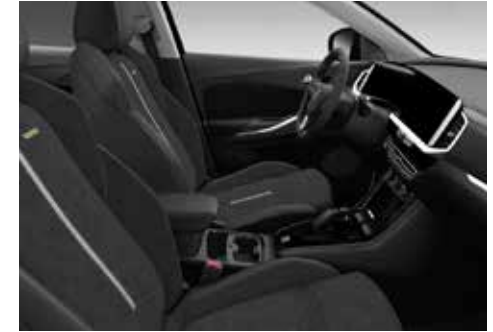
Jet black GSe Alcantara Suede with leather effect seat trim