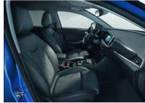
Jet black Alcantara suede with leather effect seat trim