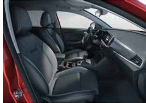
Jet black fabric seat trim inserts with black premium leather-effect side bolsters