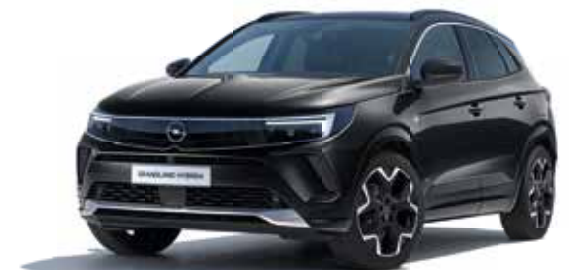
Diamond Black* coat metallic paint