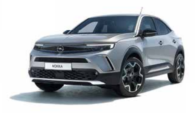
Grey Artense*** Metallic paint*