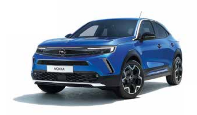
Voltaic Blue*** Metallic paint*